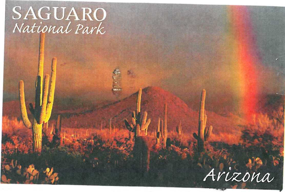
Saguaro National Park, Arizona

Land of mysteries. A dry desert teeming with wildlife and dense plant life. And always the saguaros with arms reaching toward the blue sky. A rugged terrain beckons visitors to explore and discover. Saguaro National Park, a place to wander and wonder.